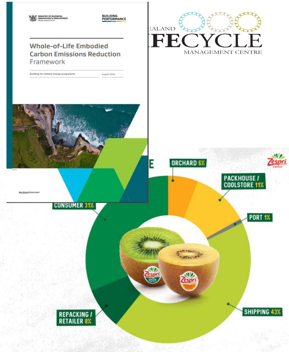
Figure 2. Contribution of each stage in the supply chain to the carbon footprint of Zespri kiwifruit produced in New Zealand and consumed globally.

Compared to many other common food products, the carbon footprint of Zespri's New Zealand supply of kiwifruit is relatively low even though it is cool-stored for long periods and shipped all over the world (see Figure 3).